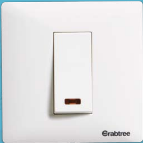
1 module inner outer plate with one-way indicator switch