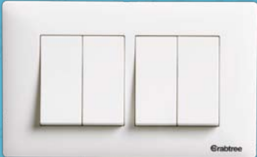
4 module inner outer plate with one-way switches