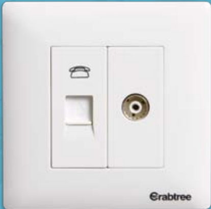
2 module inner outer plate with telephone jack & TV socket