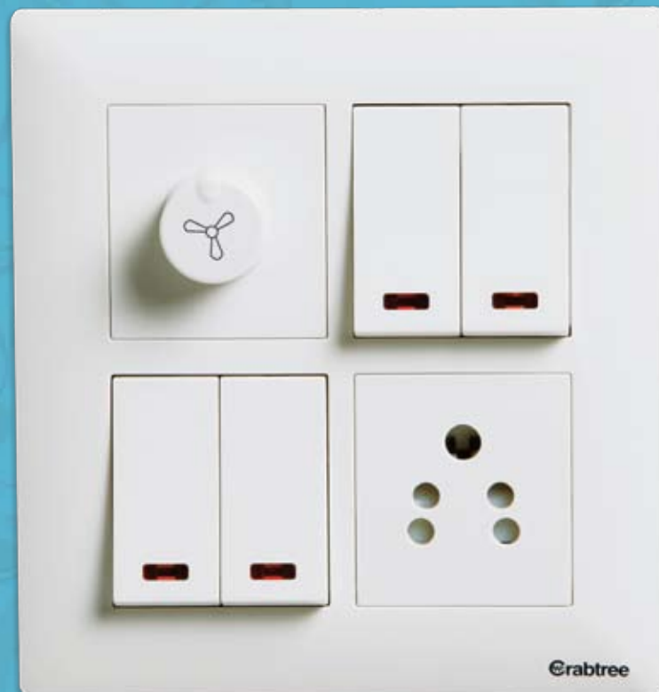
8 module inner outer plate with 2 module fan regulator, one-way indicator switches & 5-pin socket