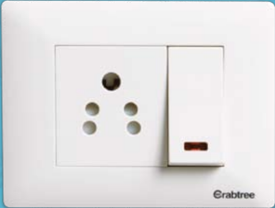
3 module inner outer plate with 5-pin socket & one-way indicator switch