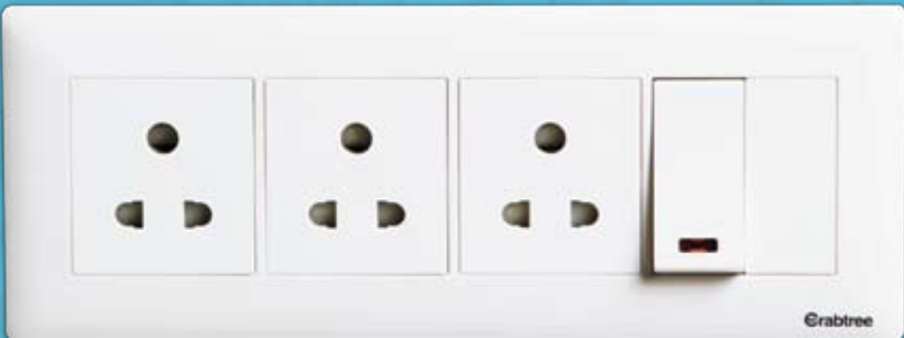
8 module inner outer plate (horizontal) with 3-pin sockets, one-way indicator switch & blank